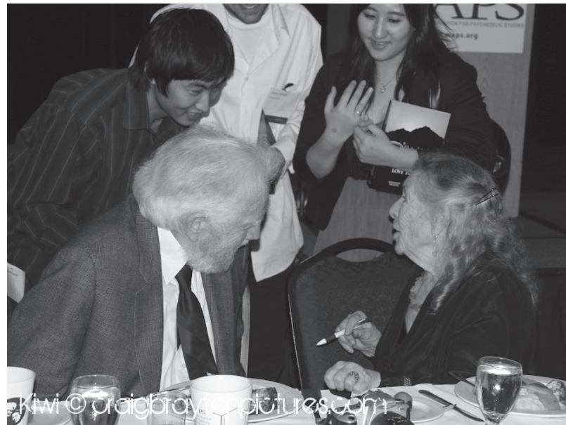
Sasha and Ann Shulgin sign copies of TIHKAL and PIHKAL at the Shulgin Tribute Banquet during the Psychedelic Science in the 21st Century conference, April 17, 2010