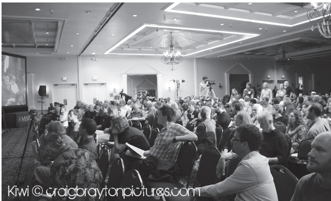
The hall was often full at the Psychedelic Science in the 21st Century conference