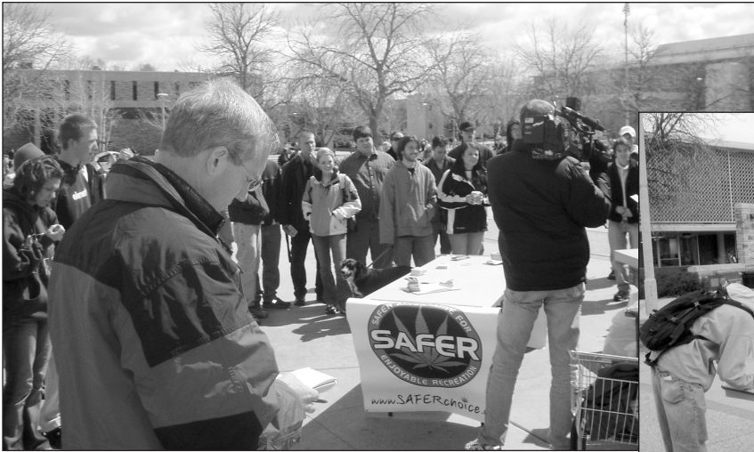
Left: SAFER draws a crowd of reporters during a protest at the University of Colorado's Coors Event Center. Below: SAFER collects signatures at Colorado State University.