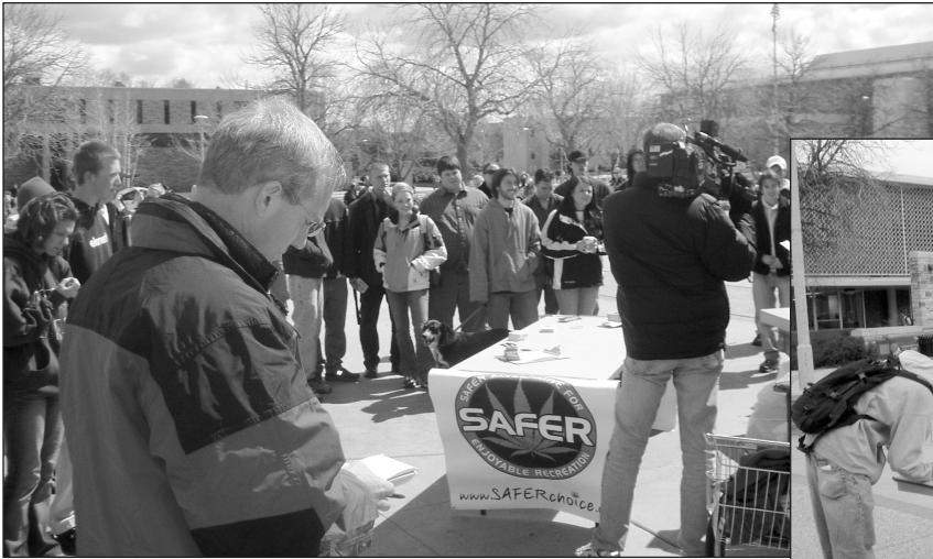
Left: SAFER draws a crowd of reporters during a protest at the University of Colorado's Coors Event Center. Below: SAFER collects signatures at Colorado State University.