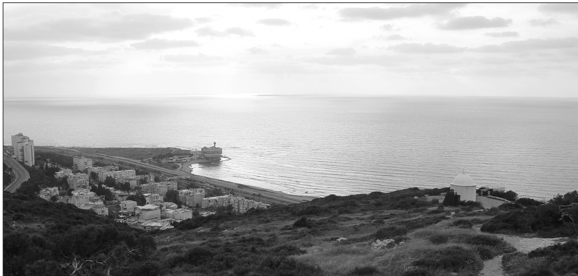
View of Haifa, overlooking the Cave of Elijah.

I would like to thank MAPS for giving me the opportunity to publish the appeal for funds, which brought us in contact with the right people. The trailer is online on the MAPS website at: http://www.maps.org/ibogaine and the entire DVD is for sale from MAPS for $20 plus $4 shipping. You can also visit the website of the film's production company [ www.lunartproductions.com ], where all the info on this project is online.