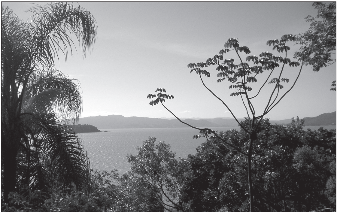
The view from the Wasiwaska EEG lab

EEG pilot research because it may open important new lines of investigation for EEG and consciousness-oriented research. Clearly, robust EEG and experiential correlates can be used to develop biofeedback protocols, which, in turn, might be used to assist individuals to reproduce the specific patterns of EEG gamma coherence that occur during ayahuasca experience, enabling them to access shamanic states without using an entheogen.