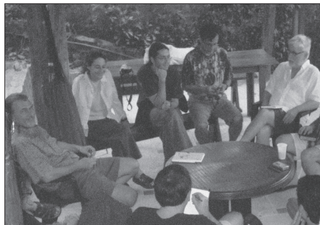
Research participants and staff